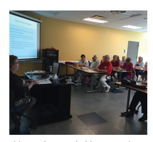
Thirteenth Annual Elder Law Fair, Syracuse, New York

To learn more about the Volunteer Lawyers Project of Onondaga County, visit www.onvlp.org.